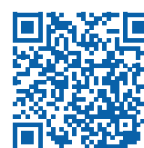
Virtual Learning Resources

Copyright © Intel Corporation. All Rights Reserved. Other names and brands may be claimed as the property of others.