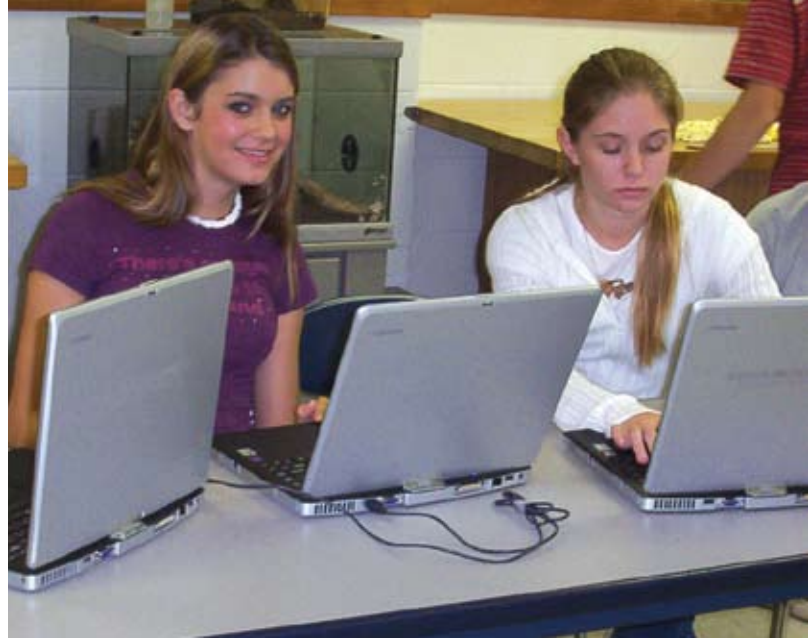
Students use tablet technology at Osawatomi High.

In 2002, Osawatomi High had three 30-person computer labs that existed at capacity during school hours. Teachers had to reserve a lab one month in advance to get students access to the computers. Teachers and students were frustrated – no one seemed to be completing their work. The administration knew of the problems and was open to conversation to introduce new technology and try to change things at Osawatomi High. Decision-makers in the district knew Osawatomi was in need and were ready to invest the necessary time and funding on technology.